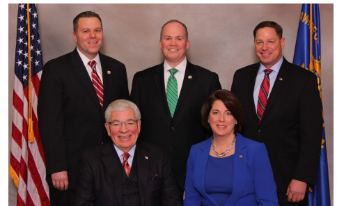
Delaware County Council