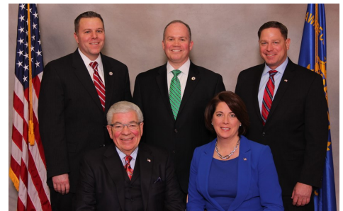
Delaware County Council