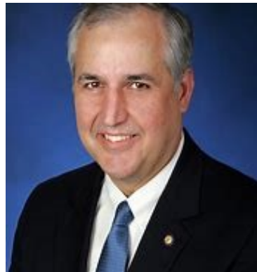
Judge Dominic Pileggi

The Central Delaware County League of Women Voters proudly presents its first-ever civics education half-day conference featuring Delaware County Court of Common Pleas Judge Dominic Pileggi as keynote speaker, Oct. 13, 9 a.m. to 12:30 p.m. at Trinity Episcopal Church Parish Hall, 301 N. Chester rd., Swarthmore, Pa.